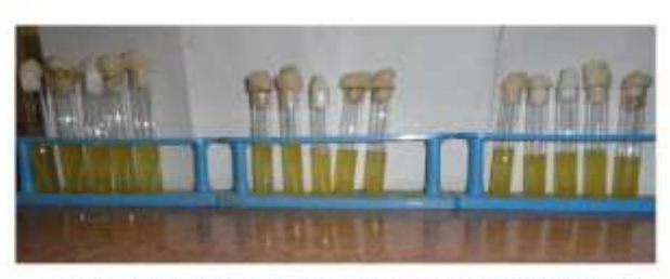
POSITIVE MPN TEST OF AEROBIC STABILIZATION POND. BIKANER